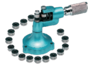
Ring Stretcher with 17 Dies