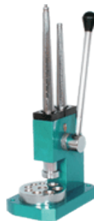
Double Head Ring Stretcher / Expander