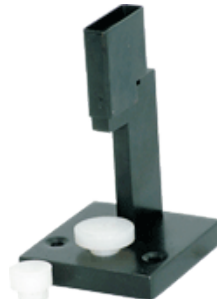
ITEM NO. : JEQ-570