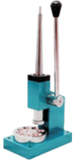
ITEM NO. : JEQ-210