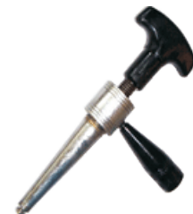
ITEM NO. : BEN-620