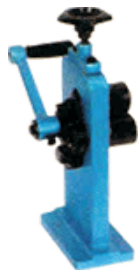
ITEM NO. : JEQ-260