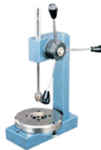
Ring Expanding Machine with 12 Collets