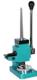
ITEM NO. : JEQ-230